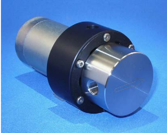
Pump shown with 1/8"-NPT side ports